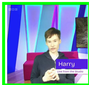
Live Weather Report

If your child is ill — such as showing fever or chills, body aches, dry chesty cough, sore throat, headache, stomach pain, diarrhoea, or vomiting — please keep them at home until they are fully recovered (48 hours in the case of diarrhoea, or vomiting). By doing this, you help us reduce the risk of class closures and keep our school community as safe as possible.