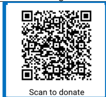
Scan to donate Sensory Room QR Code