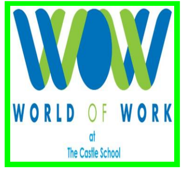
Read all about the Wonderful World of Work

For more information and news please visit us at www.thecastleschoolnewbury.org.uk