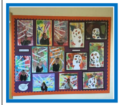
All About Me art