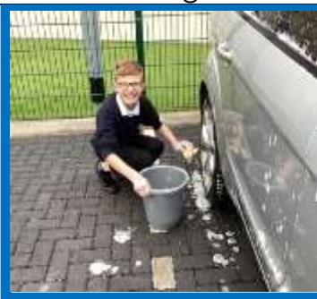
Castle Car Wash!