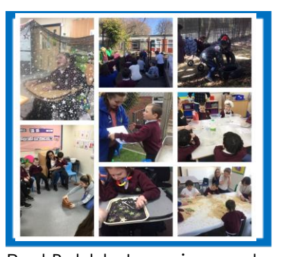
Red Bubble Learning and having fun