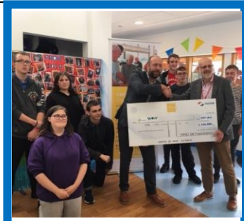
Thanks to Vinci for helping us to buy a new vehicle