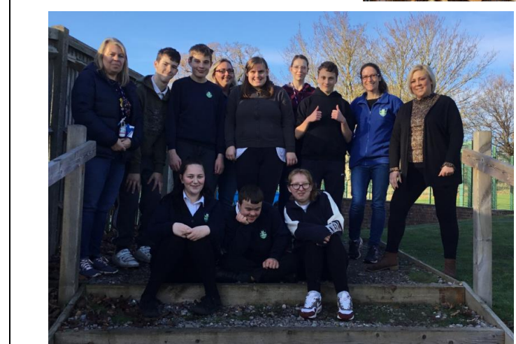
Dates & Points to remember: