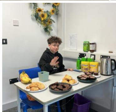
The opening of Rio's snack shack