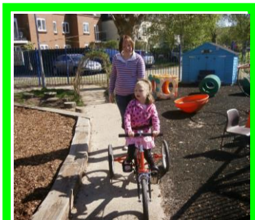
Our new trike!

we have been able to get one. This amazing piece of equipment will enable all our young learners to experience the benefits of cycling whatever their abilities.