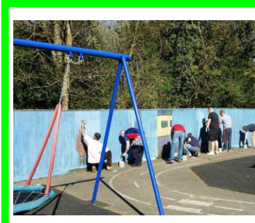
Vodafone working hard