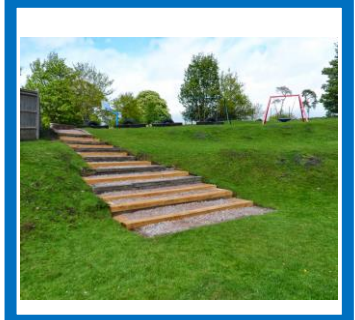
SSE's completed steps