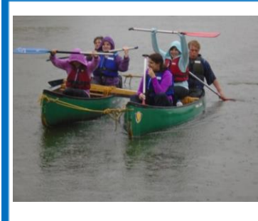
Our intrepid Duke of Edinburgh paddling along The Thames