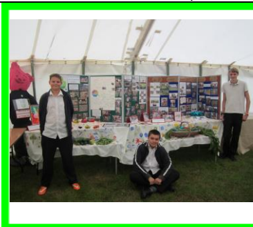
Pupil proudly present work at The Newbury Show