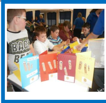
Pupils working together for Jeans 4 Genes Day