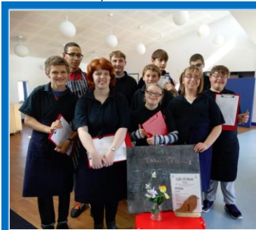
Café 16 Team ready to serve you