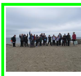
On the beach!

Please remember to visit our website at www.thecastleschoolnewbury.org.uk where you can read more about the stories in the photographs above.