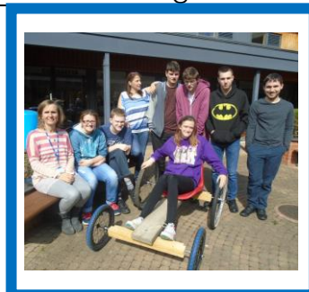
Post-16 Go-kart project