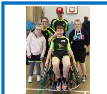
The Kennet Games