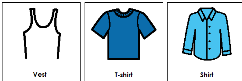
Examples of visuals

We will liaise with school staff ensuring continuity and to help your child generalise their learning.